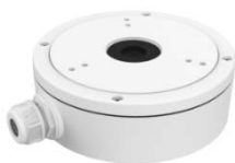
1280ZJ-M Junction Box