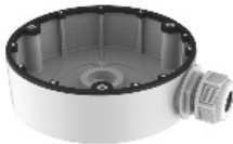
1280ZJ-DM8 Junction Box