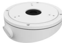
1281ZJ-M Inclined Ceiling Mount