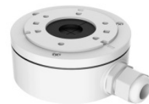
1280ZJ-XS Junction Box