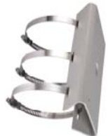
1275ZJ-SUS Vertical Pole Mount