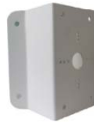
1276ZJ-SUS Corner Mount