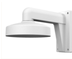
1272ZJ-110-TRS Wall Mount