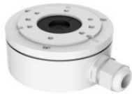
1280ZI-XS Junction Box