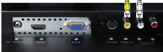
LCD19W-7 monitor back connectors