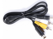
A/V In cable