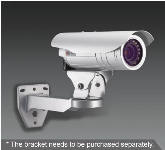
* The bracket needs to be purchased separately.